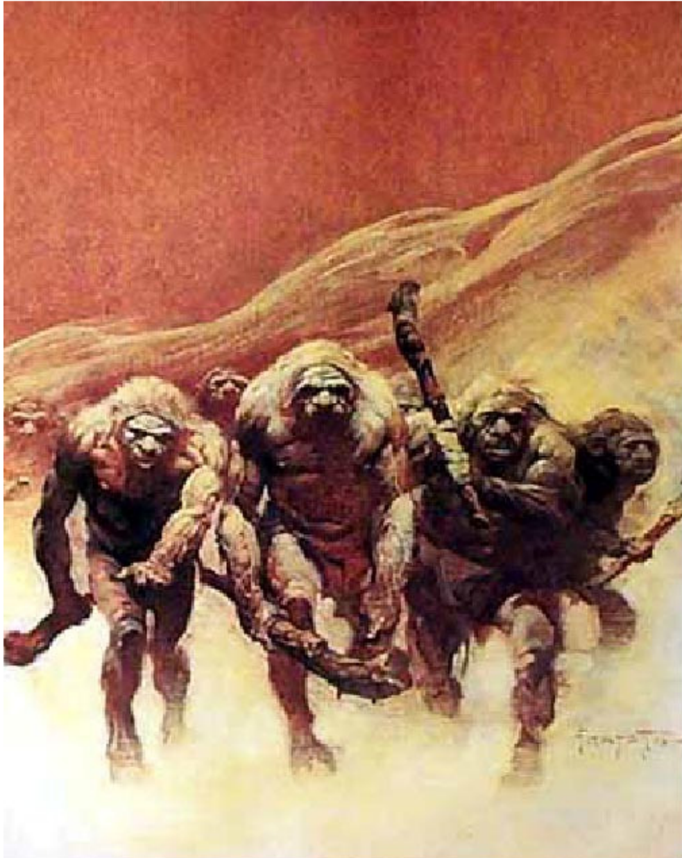
Neanderthals of the "Toxic Lozenge" on a rampage, circa 50,000 BC.